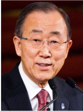
Ban Ki-moon Chair